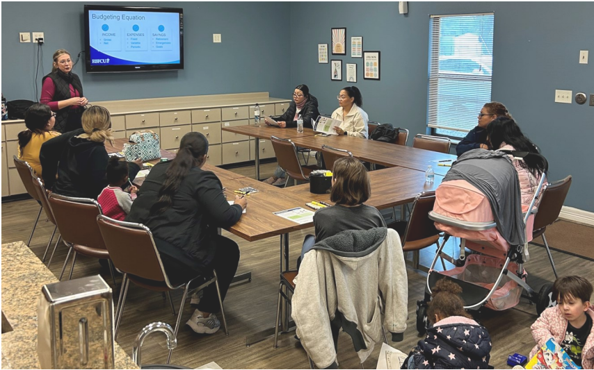
We started 2024 with a budgeting class provided by RBFCU