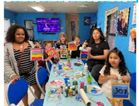
The kids at the PODER after school program created some beautiful painted art recently!

111 E San Antonio St. San Marcos, TX 78666