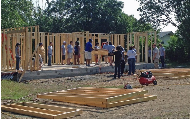
Volunteers work on 325 Stillwell Street in 2014.