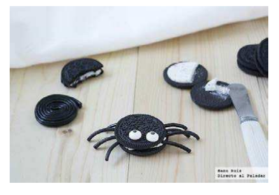
Ingredientes: Galletas oreo, regaliz negro en espiral.