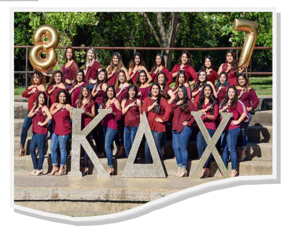
Upcoming Events at KAD:

KDChi has helped the community in many ways including school supply drives, hosting annual events such as Halloween Carnivals, Easter Egg Hunts, and National Night Out. They love the kids here and enjoy being their positive influences. KDChi members have created close bonds with our kids as they help them achieve success, aspire to do greater things, and grow as individuals. In the 2016-2017 academic year, the local SCDChi chapter completed nearly 1,000 community service hours at KAD. They are striving to increase that number for this new school year.