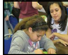
To the Left, Volunteer working with kids at CM Allen.