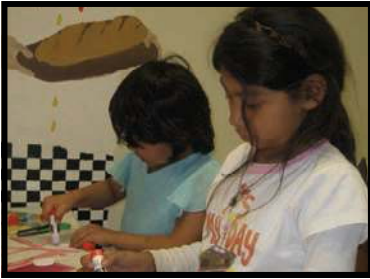
Kids making Valentines to decorate the PODER Learning Center.