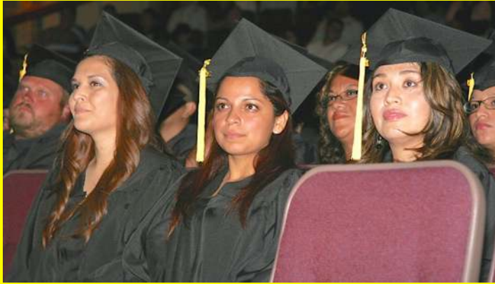
2013 GED Graduates