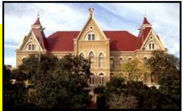
Completed in 1903, the red-roofed, castle-like landmark called Old Main, was Texas State's first building. Back then, it was called Southwest Texas State Normal School.