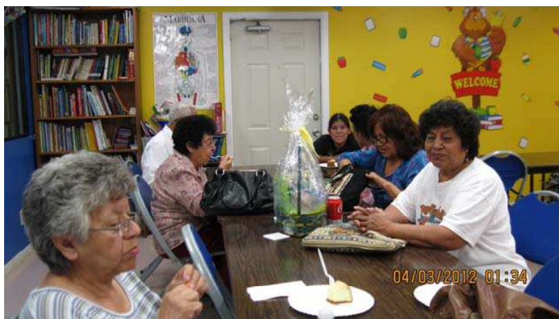
CM Allen residents enjoy the senior social — day full of laughs, good food, and great prices.