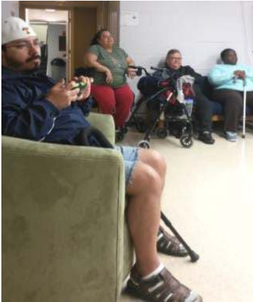
Residents wait for results.