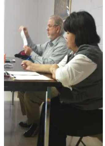
Ballots are counted.