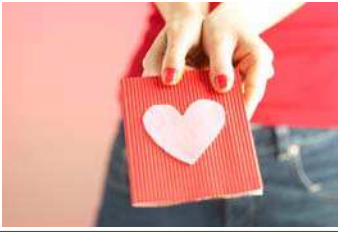
Happy Valentine's Day!