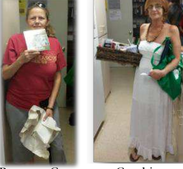
Ramona C. $25 gift card