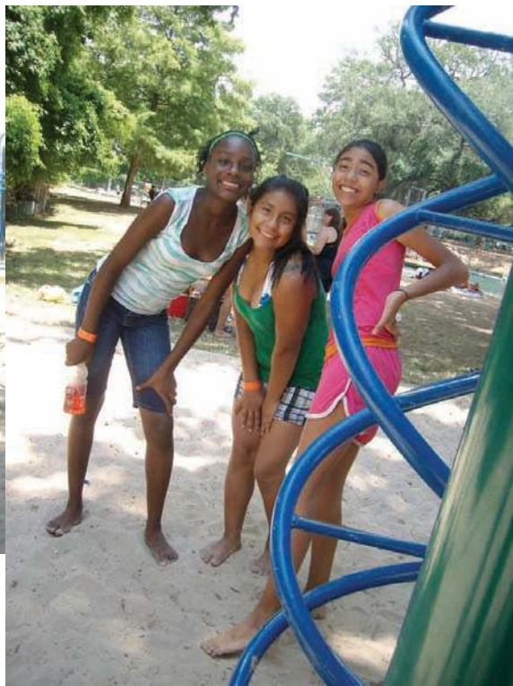
HOUSING AUTHORITY KIDS HAD A GREAT TIME AT LANDA PARK. IT WAS ANOTHER ONE OF THE SUMMER'S "COOL" EVENTS.