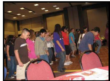
Dancing and playing on the campus of Texas State University .