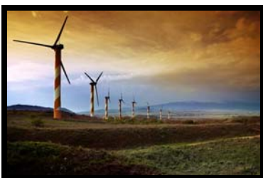
The Winds of Change are Blowing!