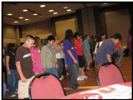
Dancing and playing on the campus of Texas State University .