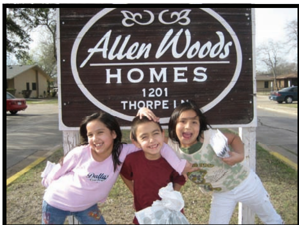
Kids having fun while delivering "The Oracle."