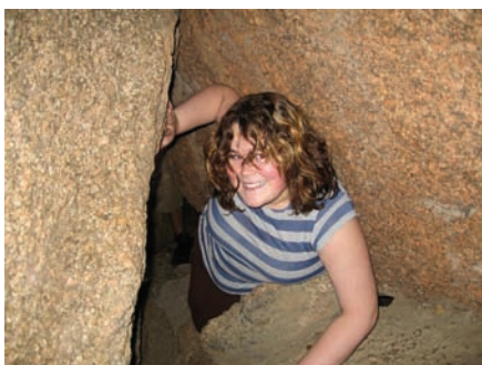
Exploring a cave on Spring Break at Enchanted Rock.

The Campus Ministry from Texas State University showed the kids how to make hand puppets.